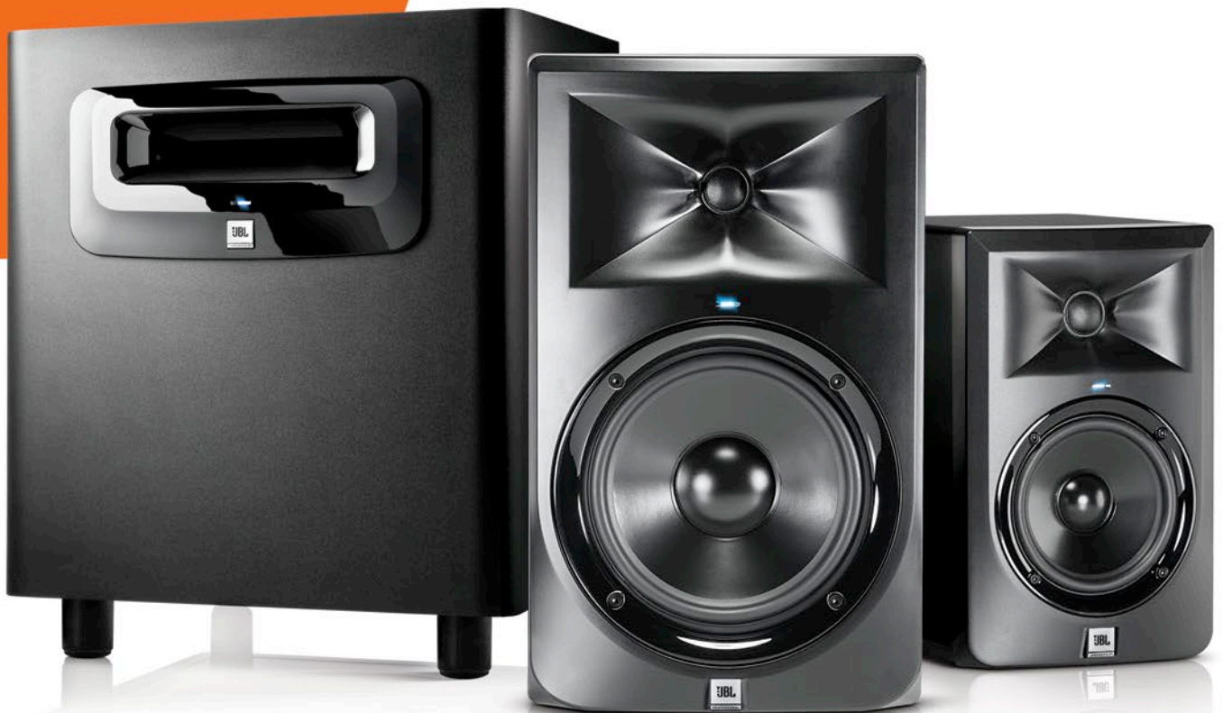
LSR310S POWERED 10" STUDIO SUBWOOFER

Introducing the 3 Series Powered Studio Monitors. The first to incorporate JBL's groundbreaking Image Control Waveguide, providing detail and depth like never before. Micro-dynamics in reverb tails, the subtleties of mic placement are clearly revealed. A realistic soundstage creates the tangible sense that there is a center channel speaker. 3 Series' broad, room-friendly sweet spot means everyone in the room hears the same level of dimension and transparency. With legendary JBL transducers, custom-designed power amplifiers, and the waveguide technology from our flagship M2 Master Reference Monitors, the surprisingly affordable 3 Series will boost the image in your studio.